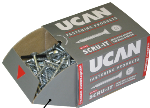
New box with flip-out side for easy access