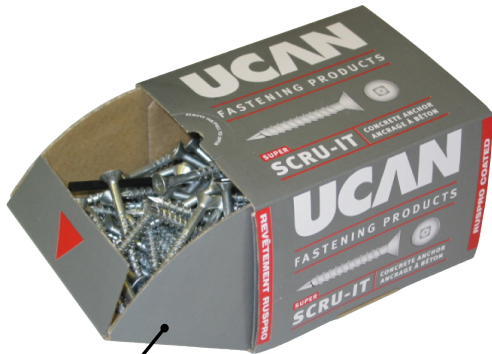
New box with flip-out side for easy access