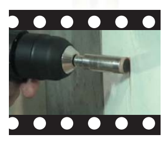
For instructional video visit our website at www.ucanfast.com